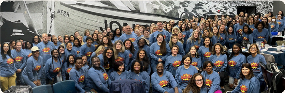
Staff Development Day

“The Power of Winning Together” came to life during our annual Staff Development Day! Team members gained valuable insights from engaging speakers and had fun with Compliance Bingo, CARF Jeopardy, and games at Dave & Buster’s. A big thank you to all who made the day a success—here’s to continuing our winning streak together!