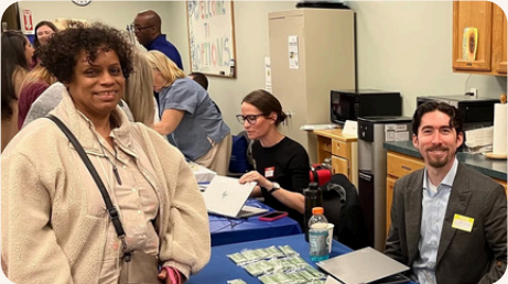
Health & Wellness Day

Our Third Annual Employee Picnic brought everyone together for a fun afternoon filled with games, arts and crafts, and plenty of time to relax and connect. Held at the Ronkonkoma Office, the event featured delicious BBQ, great company, and a chance to celebrate and appreciate our dedicated staff.