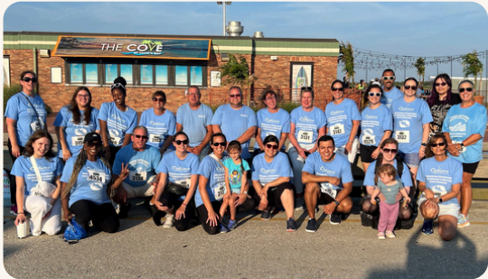
Community Engagement Walks

“The Power of Winning Together” came to life during our annual Staff Development Day! Team members gained valuable insights from engaging speakers and had fun with Compliance Bingo, CARF Jeopardy, and games at Dave & Buster’s. A big thank you to all who made the day a success—here’s to continuing our winning streak together!