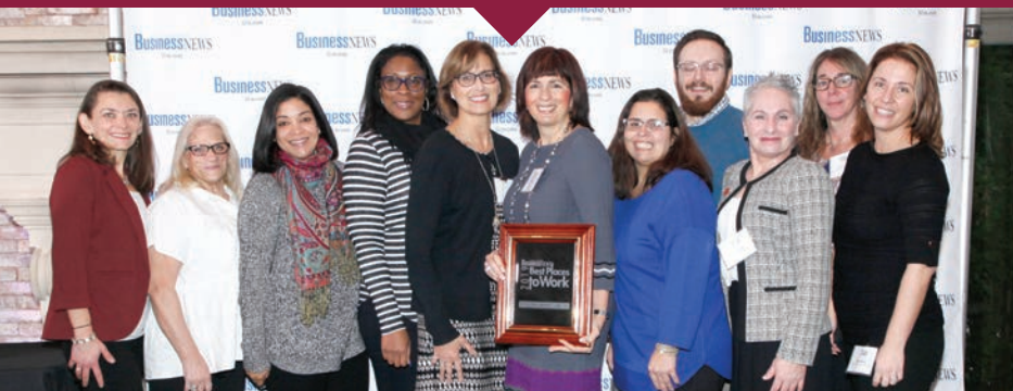
Options received the 2019 Long Island Business News Top Workplace Award